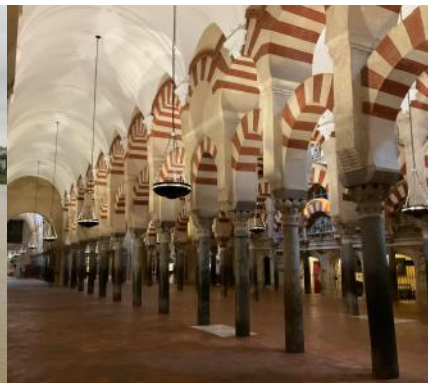
Arches in the Mosque